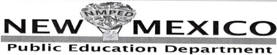
EXHIBIT B (24346 - FINAL FY22-23)