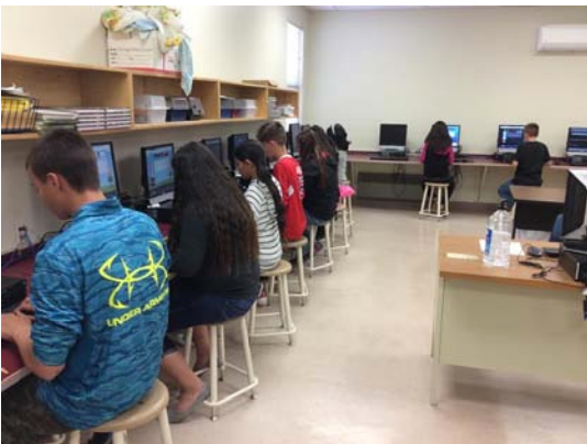
Mrs. Vigil's typing class hard at work.

(One student is typing 57 wpm with 97% accuracy and another is typing 54 wpm with 97% accuracy.)