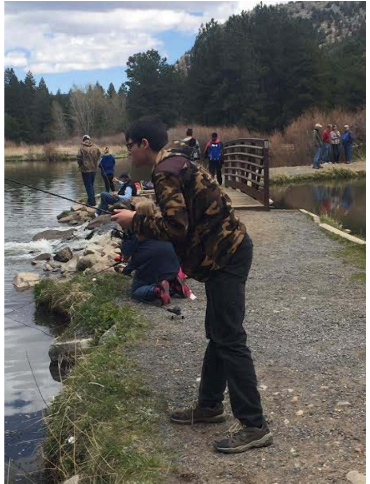
Students enjoy river water testing and fishing during the CHS school wide field trip to Maverick Campground.