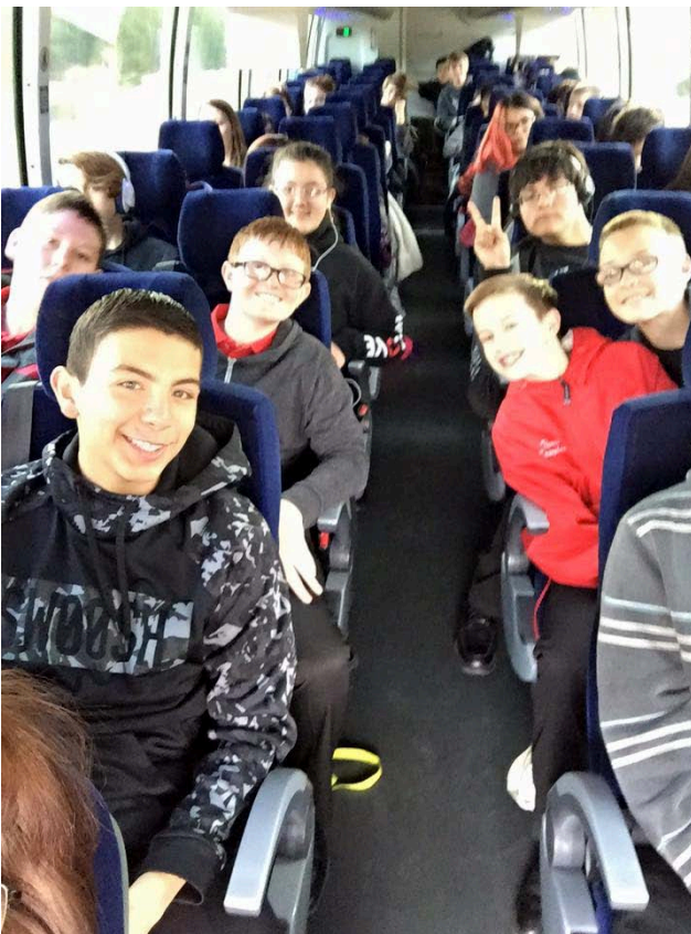
Band Students on their way to District Band.