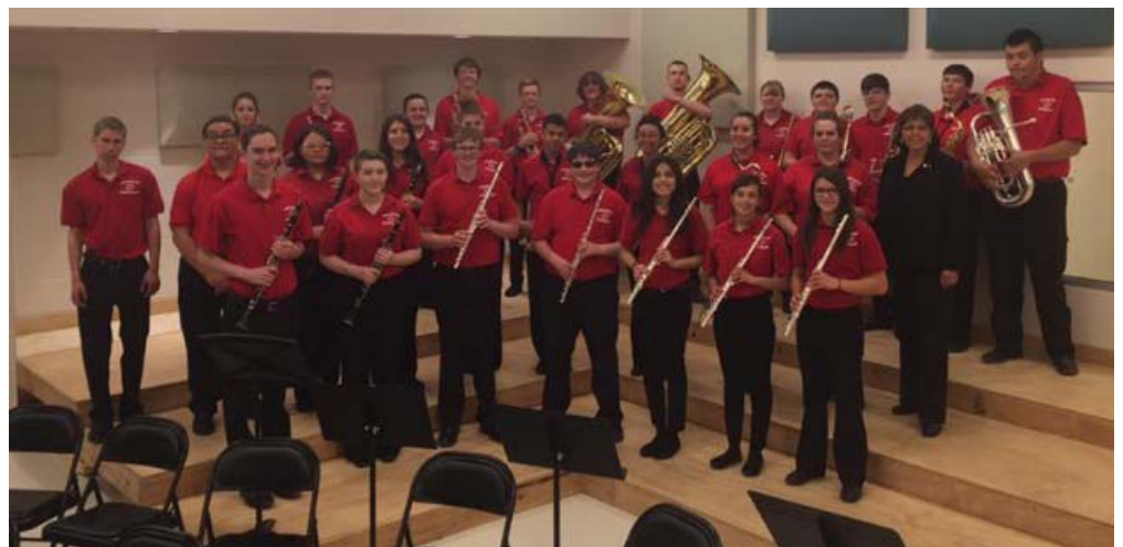
Left: Cimarron students working with the Curtis Institute musicians. Above: Cimarron Wind Ensemble after the district band competitions. They have qualified for state. Good luck!