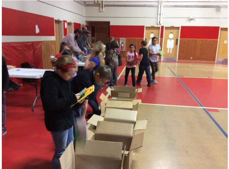
The third and fourth grade students helping with We Care packages.