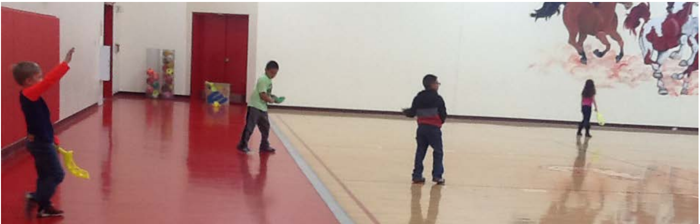
First graders in PE are learning about hand/eye coordination.