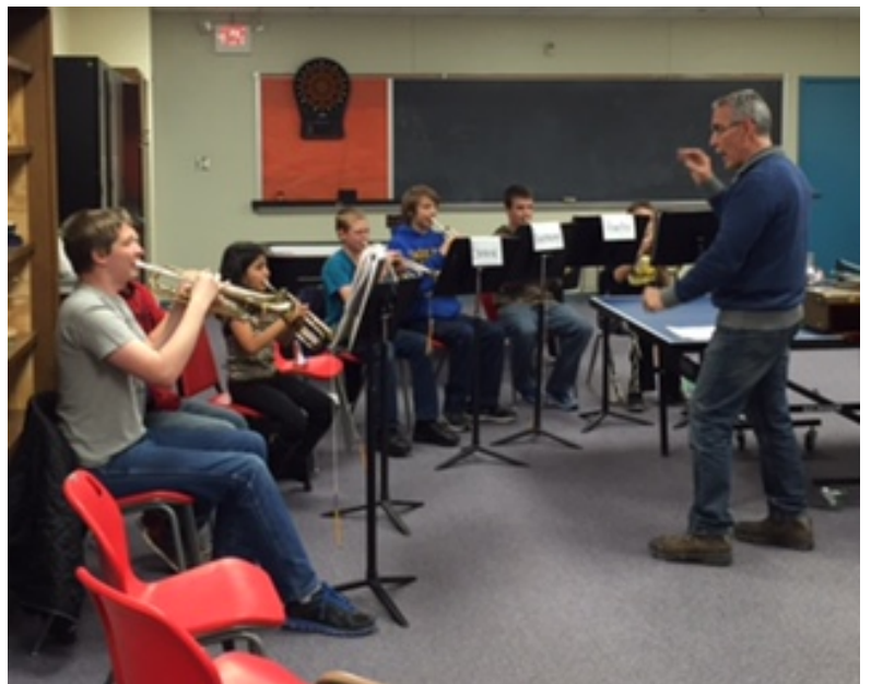
Band Boot Camp was a success.