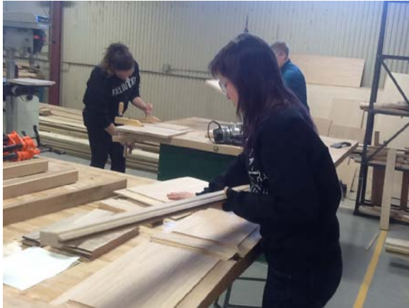
Students working on their projects in woodshop. Below, are some pieces that students are creating.