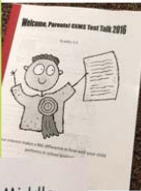
An example of the booklets we will be sharing at parent night